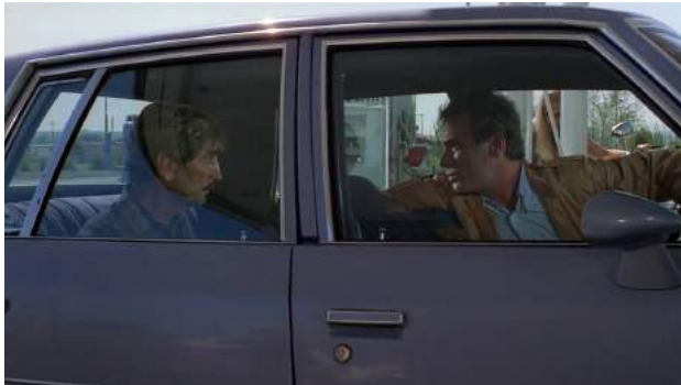
VISUAL REFERENCE - Light & Framing: Wim Wenders' 'Paris, Texas'